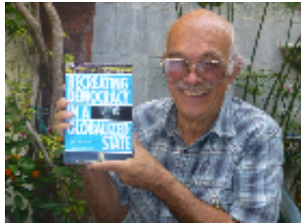
Lecturer/Author of Recreating Democracy in a Globalized State (on sale at UN event)